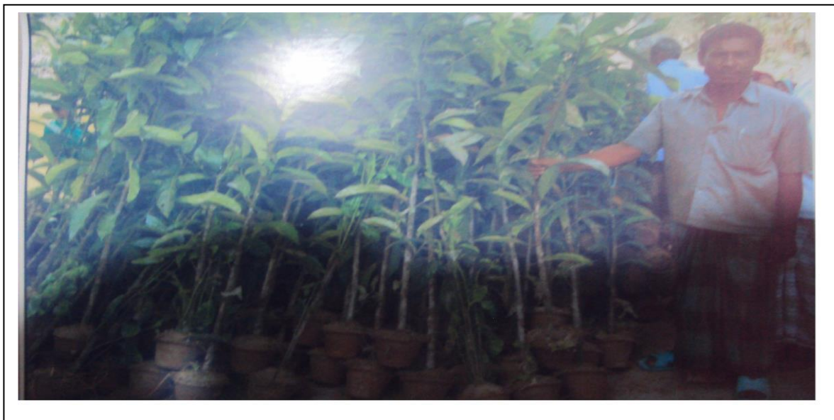
Tree Plantation Distribution of Group Members in Climate Change Project