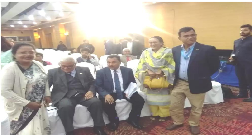
Project operation meeting with staff of JSKS